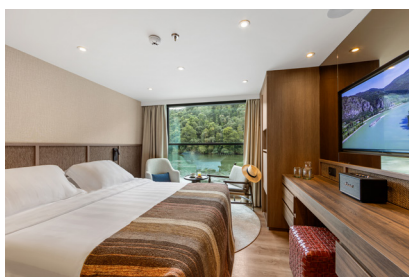
Upper & Main deck: Standard French balcony cabin