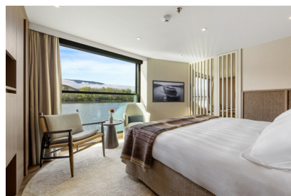
Upper deck: Large French balcony cabin