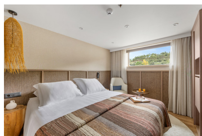
Lower deck cabin