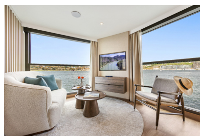
Upper deck: owners suite