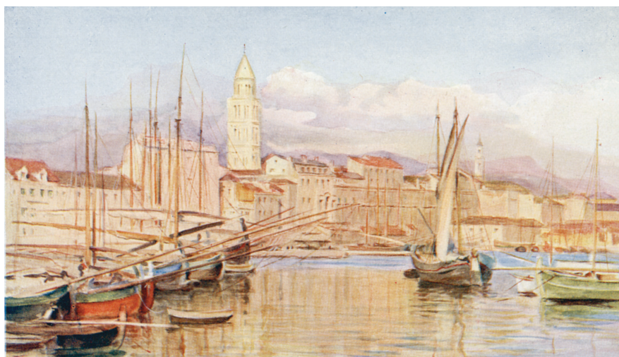
Split, watercolour by Walter Tyndale publ.1925

Our journey begins in the ancient city of Split, which presents the extraordinary phenomenon of a functioning and vibrant city centre accommodated in the remains of a vast Roman palace. The emperor Diocletian's