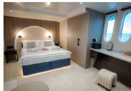
Larger main deck cabin.

Combine the October tour with: Raphael , 12–18 October 2026; Essential Rome , 13–19 October 2026.