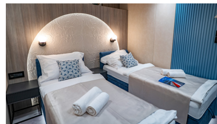
Lower deck cabin